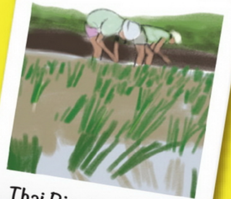
Thai Rice is Thai Life.

The attractions in Thailand are beautiful and comprise a variety of natural resources, ways of life and cultures. These appealing qualities attract people to travel to refill their happiness by enjoying Thai local experience in the route of Thai Way of Life and Way of Rice. Each route is very distinctive depending on the uniqueness of the five regions in Thailand.