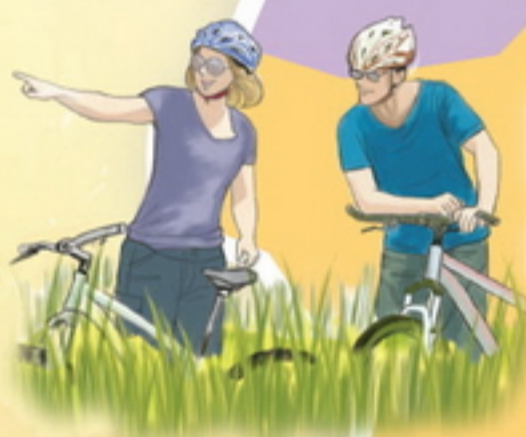
Rice & Cycling