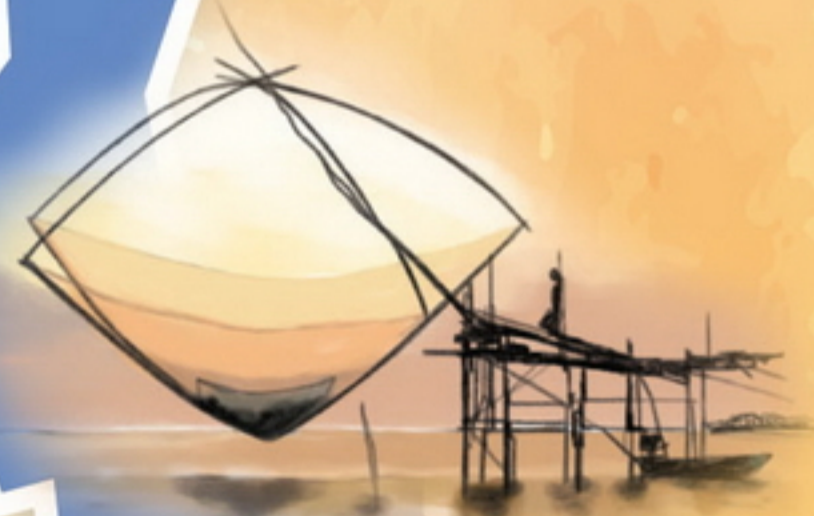
Rice & Happiness