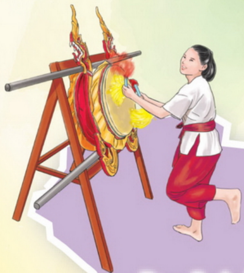
Rice & Art