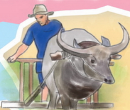
Rice & Learning