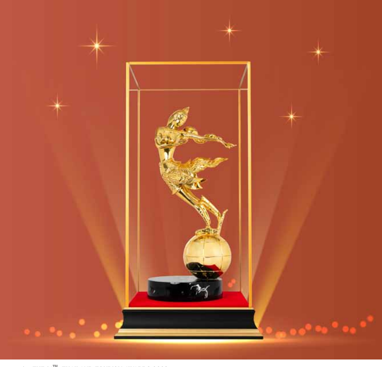
6 • THE 14<sup>TH</sup> THAILAND TOURISM AWARDS 2023